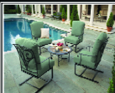
CHAT DEEP SEATING

SAVE ON SELECTED BBQ GRILLS, CUSTOM BBQ ISLANDS AND PATIO FURNITURE